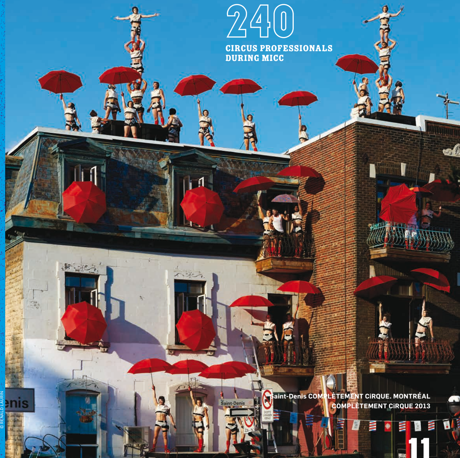
Saint-Denis COMPLÈTEMENT CIRQUE. MONTREAL COMPLÈTEMENT CIRQUE 2013