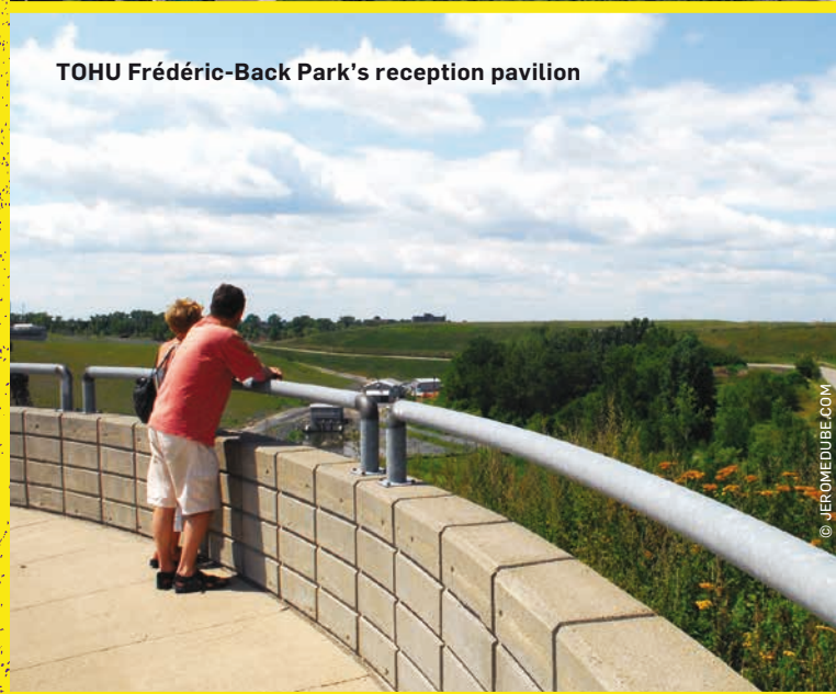
TOHU Frédéric-Back Park's reception pavilion