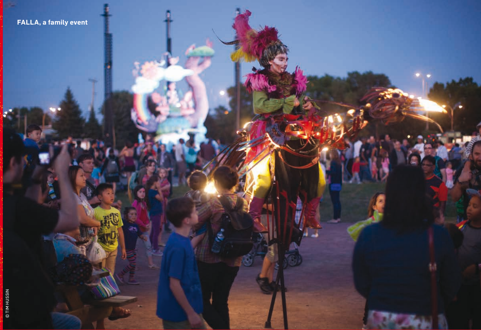
FALLA, a family event