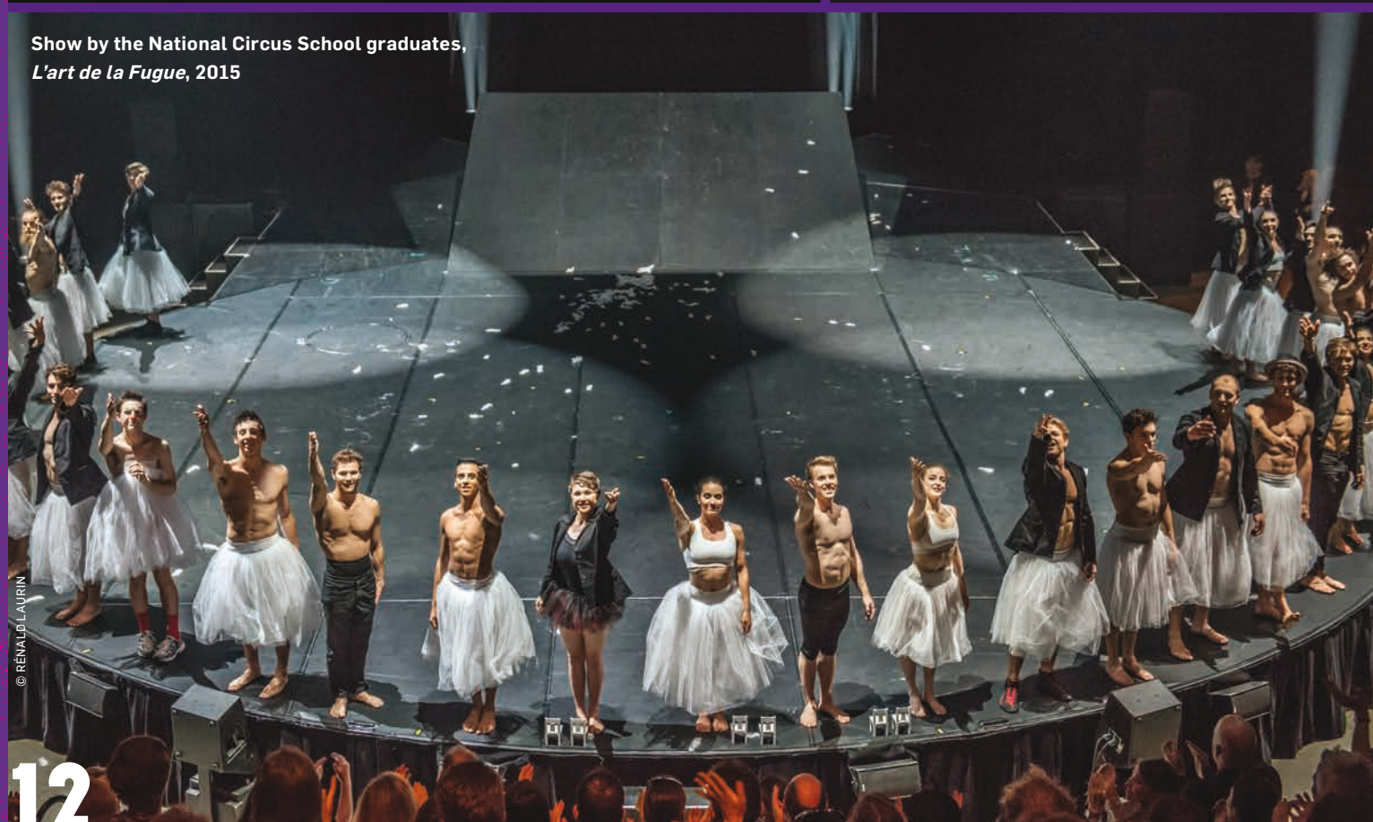
Show by the National Circus School graduates, L'art de la Fugue , 2015