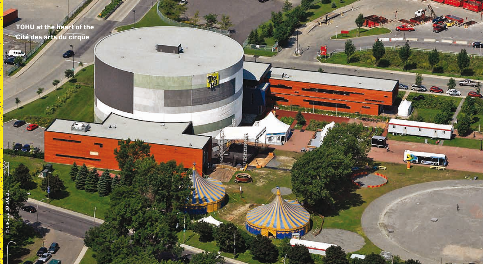
TOHU at the heart of the Cité des arts du cirque